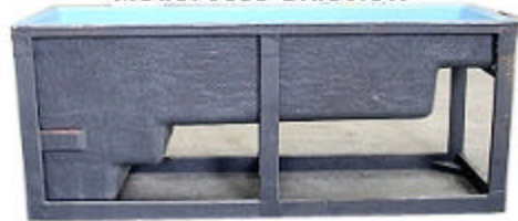
Model 9533 Sideview

The model 9B is a portable baptismal. Designed to be used "as is" or behind your wall or within a cabinet you supply, it has the built in seat to make this a "Dry Minister" Design. Fill or drain with a garden hose or install a drain as you wish.